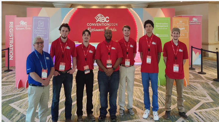
The ABC MA team celebrating after the awards ceremony at the 2024 National Craft Championship.

ABC presents the Local and National Craft Championships each year to highlight the achievements of the people who represent the future of the construction industry. Craft trainees and apprentices compete locally, travel from across the country to demonstrate their superior skills, training and safe work practices, and to compete for top honors in their chosen craft.