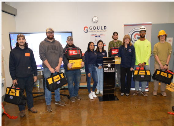
The local craft competitors happily showing off their prizes.