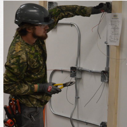
A local competitor focused intently on his task.